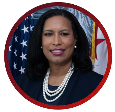
The Honorable Muriel Bowser Mayor, District of Columbia LGW Class of 2013 2026 Leader of the Years

For more information on the event and honoree, visit lgwdc.org/celebration2026