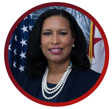
The Honorable Muriel Bowser Mayor, District of Columbia LGW Class of 2013 2026 Leader of the Years

For more information on the event and honoree, visit lgwdc.org/celebration2026